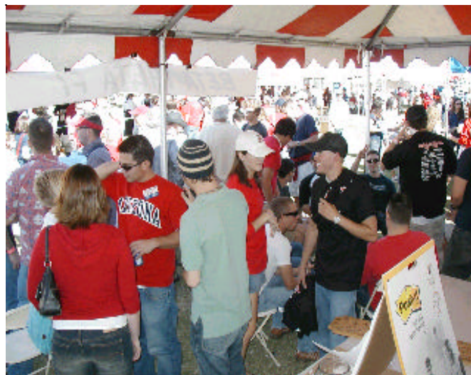
Members of Beta from the past and present all came together this year at our annual Homecoming tent on the mall

■ Don't forget to check our website http://clubs.asua.arizona.edu/~beta/ .