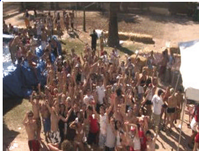
Fall '03 Beta Theta Spike Volleyball Tournament

The sun was shining and the pool was refreshing this year at our second annual Beta Theta Spike volleyball tournament