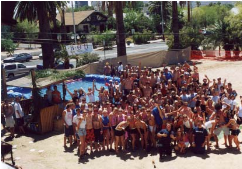
Spring '02 1st Annual Beta Theta Spike

Hundreds of people came to party by our tiki hut, swim in our man-made pool, and watch girls play volleyball for charity. We raised around $1000 and one hell of a time!