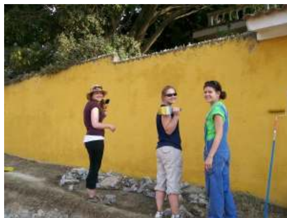
Expertly painting the wall of the ILAG