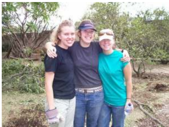
Taking a break from cutting trees to model!!