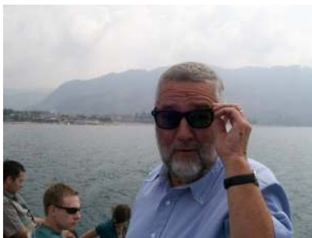
Bubba showing us just how cool he can be!