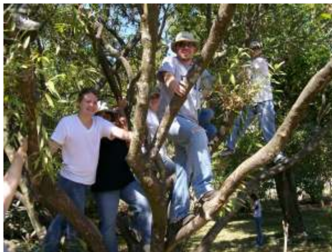
Enjoying the tree before we cut it down!