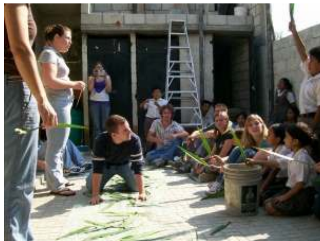
David the Burro